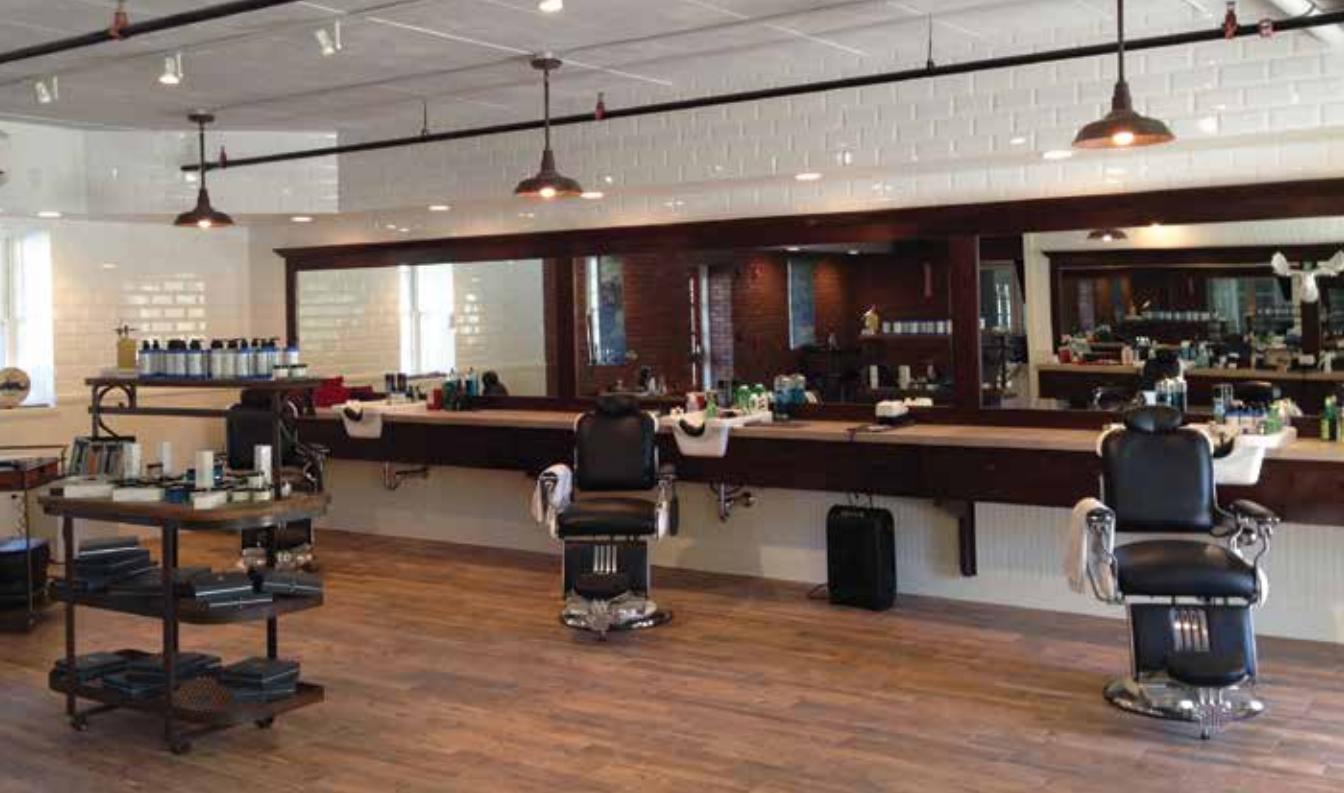
HOUNDS BARBERSHOP | Sudbury, MA