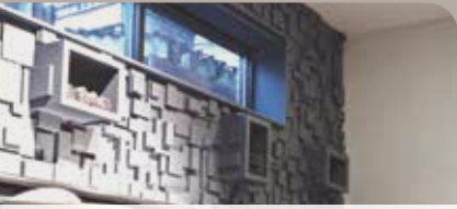
SINE QUA WEST | Chicago, IL