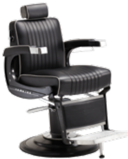
ELEGANCE ELITE BLACK BB-225B HR