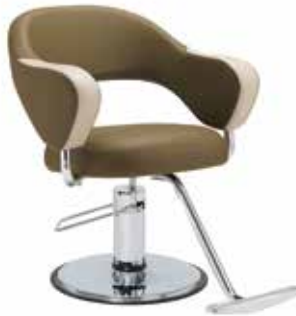
NAGI STYLING CHAIR ST-M70

A sophisticated, restyled successor to the original, the Rollerball F brings new possibilities in hair design. Speed, power, and a rotating ring help color and chemical treatments penetrate deeper and faster delivering enhanced results that last. Now boasting a slim, elegant profile and variety of colors.