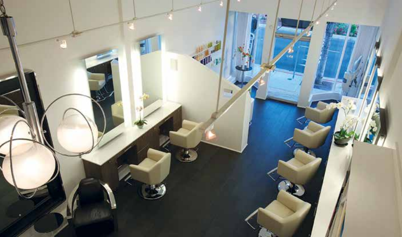
KOJI TOYODA SALON | West Hollywood, CA