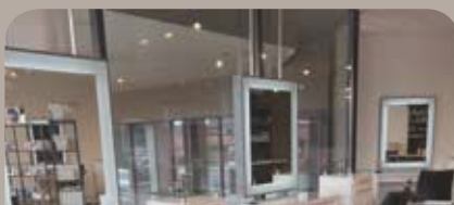
THE GLOSSARY SALON | Overland Park, KS