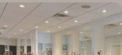
SALON DE CINZIA | Newton, MA