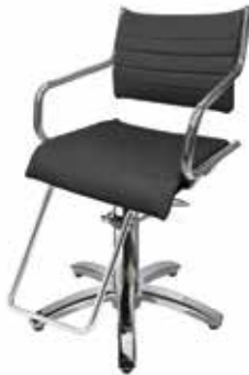
GHIA STYLING CHAIR ST-022

Superior comfort and stunning design makes the Caruso chair a perennial favorite. With smooth edges, sensual curves, extra thick foam cushions, and a firm lateral support, the styling chair features an ergonomic aesthetic that keeps both client and stylist in mind.