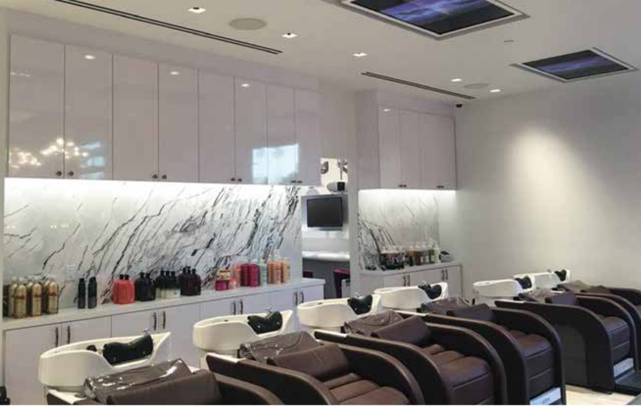
LAVENDER SALON BOUTIQUE & BLOWDRY BAR | Newport Beach, CA