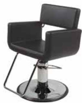
BOSSA NOVA STYLING CHAIR BMST-100

As a retro-inspired, sleek, and chic chair, the Ghia has sustained the market for over a decade. Its longstanding history of durability and performance proves it to be an honoree among styling chairs. With a well-balanced design of chrome and robust upholstery, this vintage chair brings about a sense of refinement.