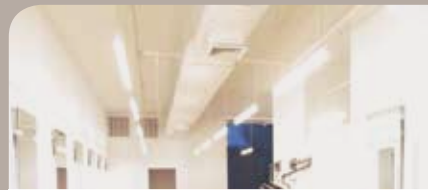
RHEANNE WHITE SALON | New York, NY