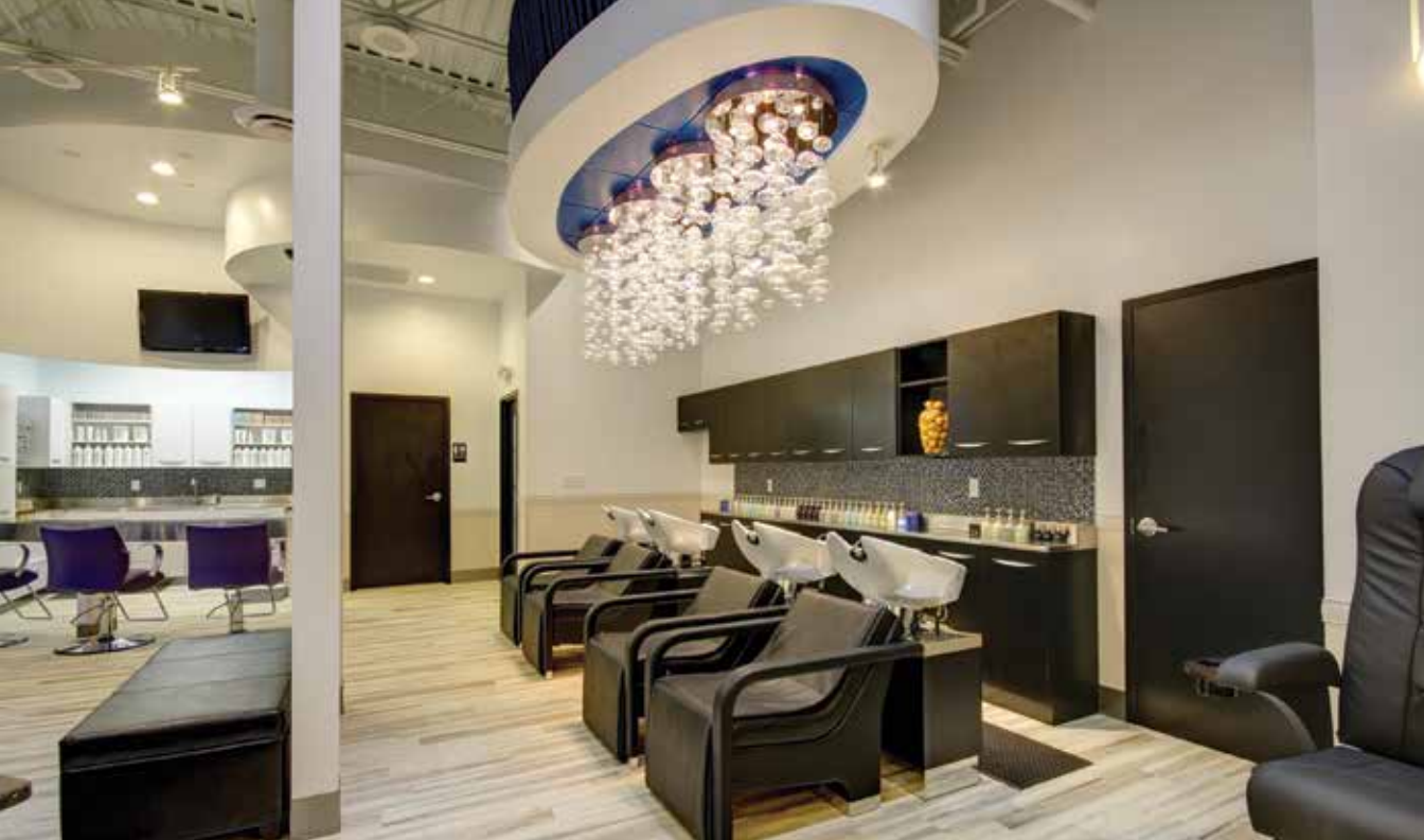
GINGER BAY SALON & SPA | Town & Country, MO