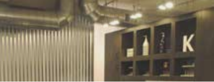
BLOOM SALON | Morristown, NJ