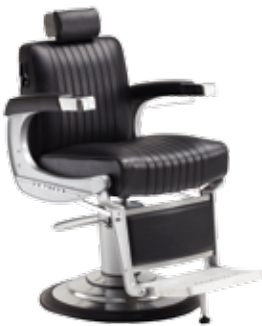
ELEGANCE CLASSIC BB-225 HR