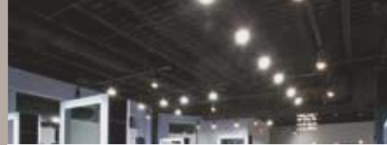
BLO SALON | Shelby Township, MI