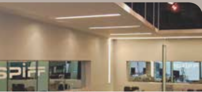
SPIFF | New York, NY