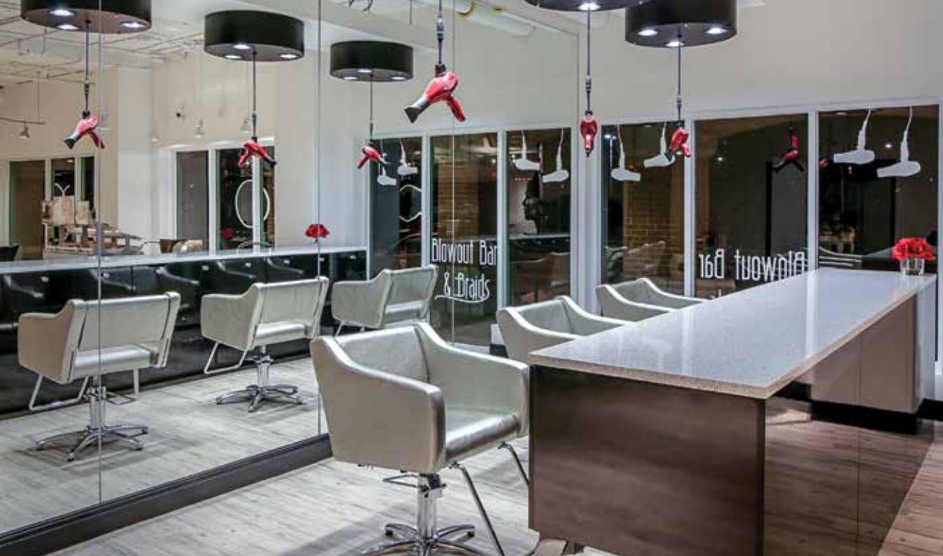
SOTO - SALON ON THE OHIO | Cincinnati, OH