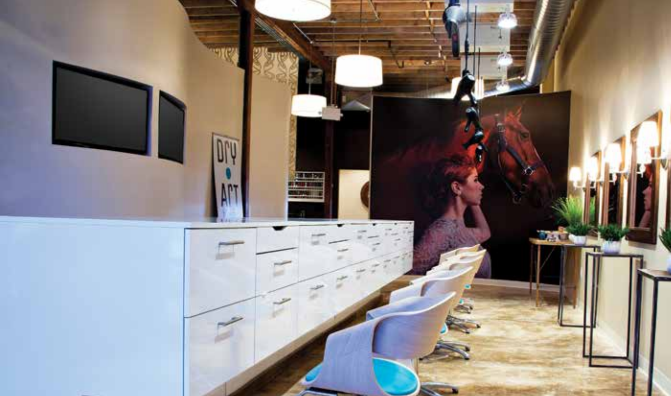
DRY ART BLOW DRY BAR & SALON | Lexington, KY

“Creativity is the power to connect the seemingly unconnected.”