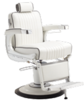
ELEGANCE ELITE WHITE BB-225W HR