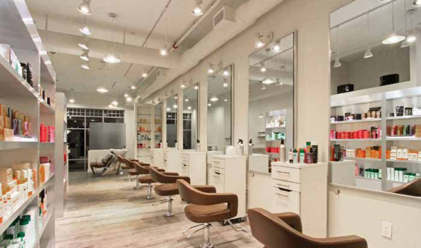
SALON BISOUX | Alexandria, VA