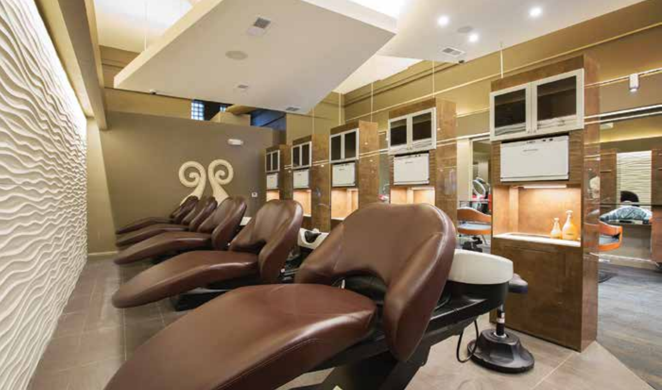
TRENDZ SALON | Palo Alto, CA

“Great quality is related to great design; you rarely get one without the other.”