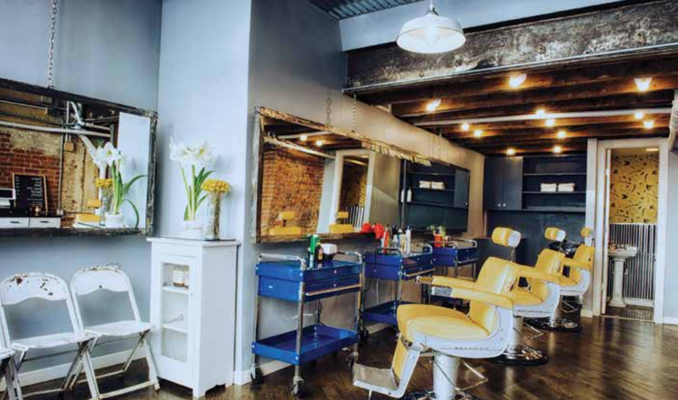
OTIS & FINN BARBERSHOP | Long Island, NY