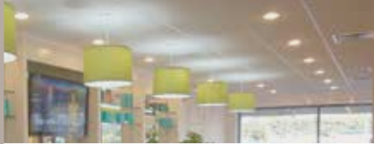
ARTISTIC IMAGE | Westport, CT