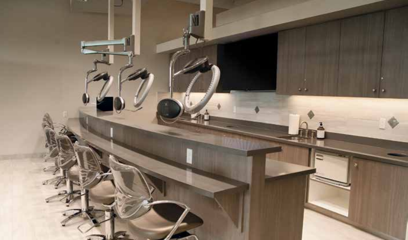
OPULENT DAY SPA | Bakersfield, CA