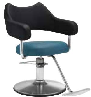
NAMI STYLING CHAIR ST-M60

The Nagi, meaning “no wave” in Japanese has been designed with exceptional comfort in mind. By employing advanced ergonomic principles to the design process, the Nagi allows clients to sit with minimal pressure on the lower body and lumbar region; due to the placement of specialized foams in the seat cushion.