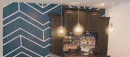
TRILOGY SALON | Indianapolis, IN