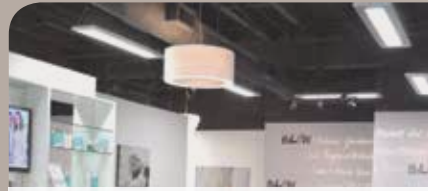
FORT WORTH BLOW DRY BAR | Fort Worth, TX