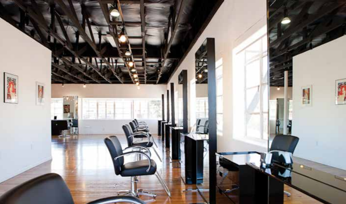
CUT HAIRDRESSING | San Diego, CA

“Truly elegant design incorporates top-notch functionality into a simple, uncluttered form.”