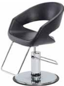
CARUSO STYLING CHAIR ST-M80

Superior comfort and stunning design makes the Caruso chair a perennial favorite. With smooth edges, sensual curves, extra thick foam cushions, and a firm lateral support, the styling chair features an ergonomic aesthetic that keeps both client and stylist in mind.