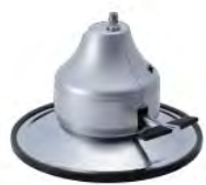
Silver (Black/ White also available)